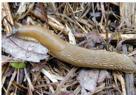
Figure 1 | Arion lusitanicus — conservation agent.

grassland sown with rye grass ( Lolium perenne ) and white clover ( Trifolium repens ) on a former arable field that contained its own residual seed bank of weed and other plant species.